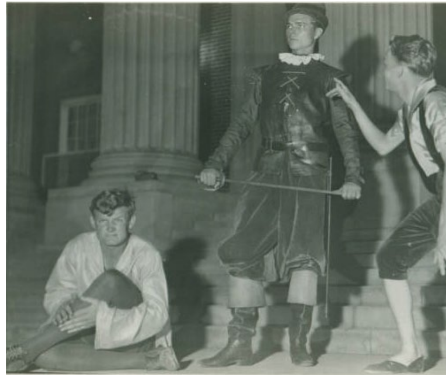
Image: "Love's Labour's Lost," 1932, SMU Arden Club, McCord-Renshaw Collection on the Performing Arts, Bywaters Special Collections, Hamon Arts Library, SMU

All's well that ends well, more or less.