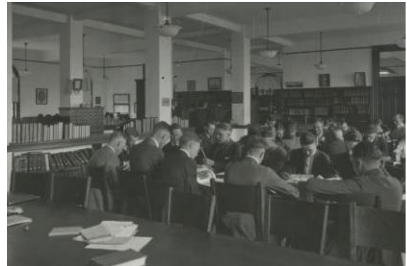
Image: Students studying in Dallas Hall library, c. 1920