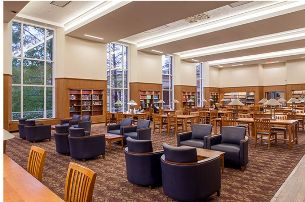
Centennial Reading Room, Fondren Library