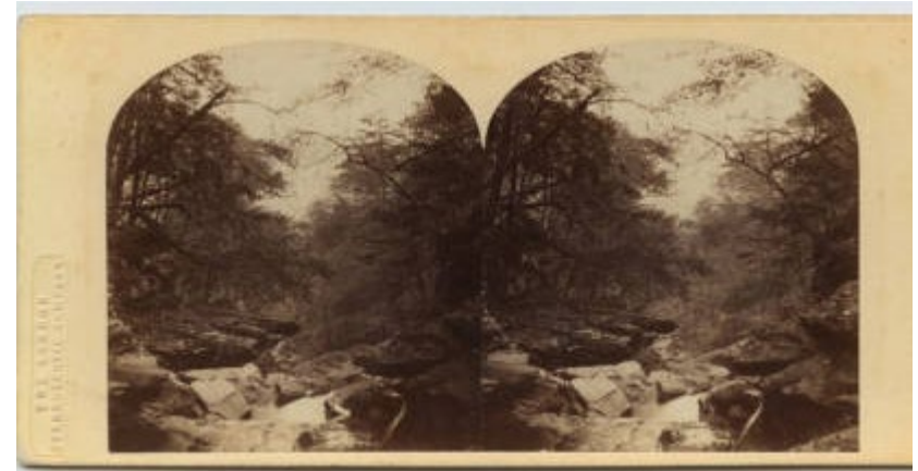
Image: View in the Kauterskill Clove, Catskill Mountains