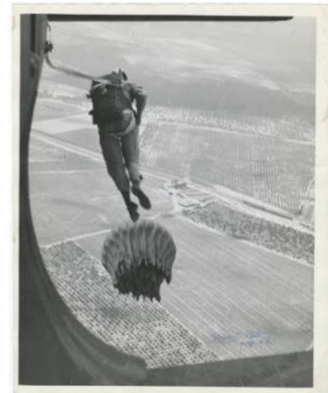
Image: Man parachuting