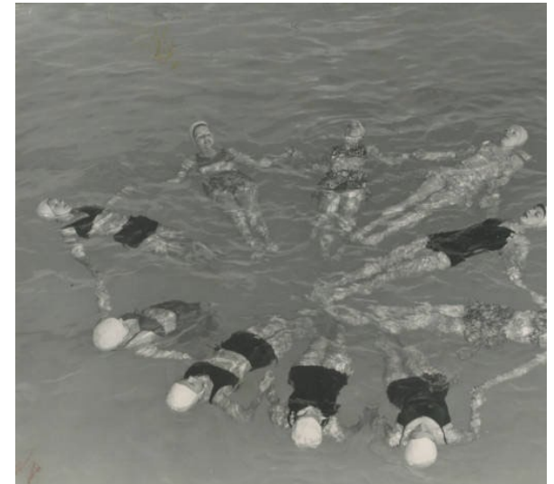
Image: Synchronized swimming, c. 1960, SMU Archives, DeGolyer Library, SMU