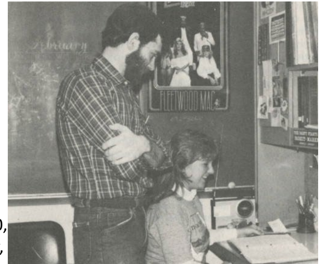
Image: Two statisticians, c. 1980