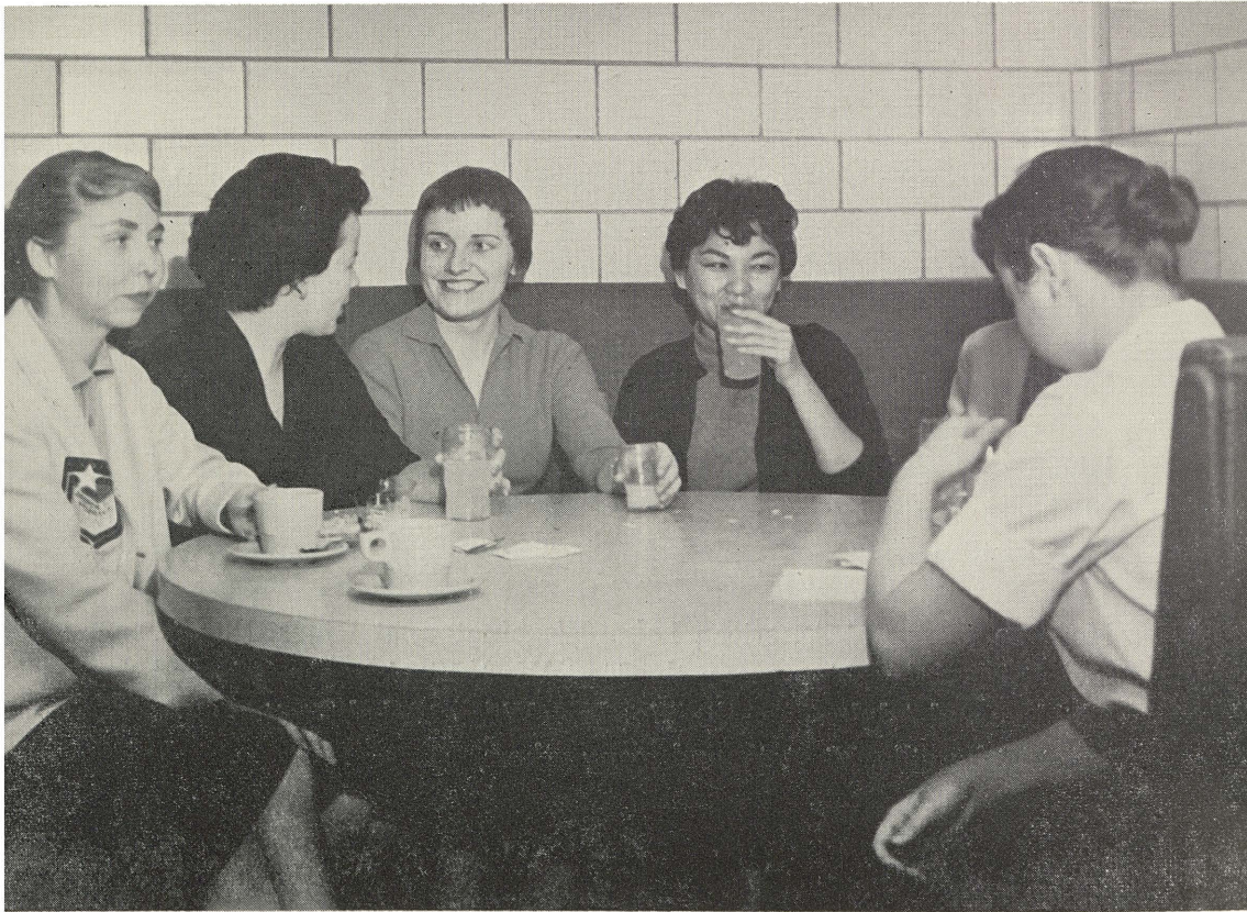
Time Out For Relaxation!

FOR HIGH SCHOOL GRADUATES: The School of Occupational Therapy of the Texas Woman's University provides an opportunity to combine professional and educational courses leading to the Bachelor of Science or Bachelor of Arts degrees and the coveted O.T.R. Those who begin their Occupational Therapy studies in the Freshman year may normally expect to complete the required sequence in five years. The curriculum in O.T., which conforms to the standards of the American Medical Association, the American Occupational Therapy Association, and of the Texas Woman's University, is shown on pages 12-13 of this booklet.