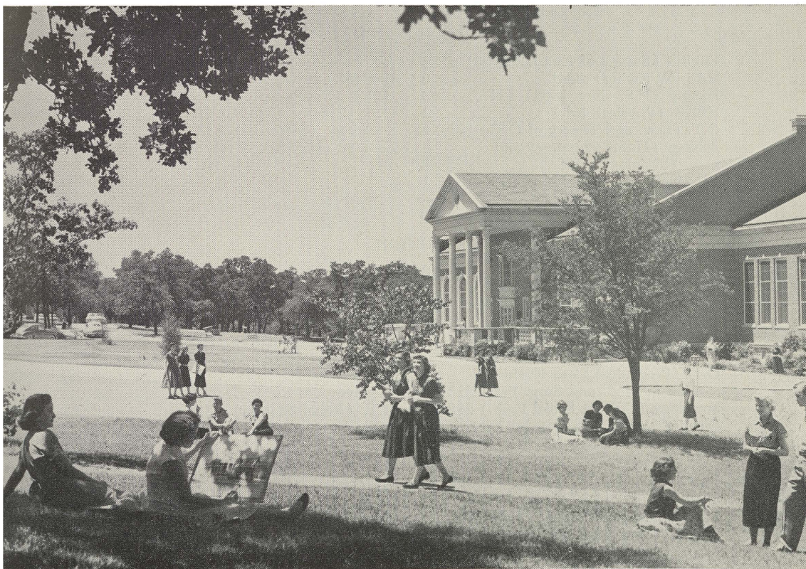
(Above) Hubbard Hall, the Central Dining Unit

FOR COLLEGE GRADUATES: Requirements may be completed for the Advanced Standing Curriculum Course in approximately two academic years. Successful completion of the prescribed courses will qualify a candidate for the certificate in Occupational Therapy, provided that she passes the Registration Examination. After completion of the required clinical courses all graduates are eligible to take the National Registration Examination offered by the American Occupational Therapy Association. Passing the examination is necessary before one becomes professionally qualified to practice and use the designation of "OTR" after one's name.