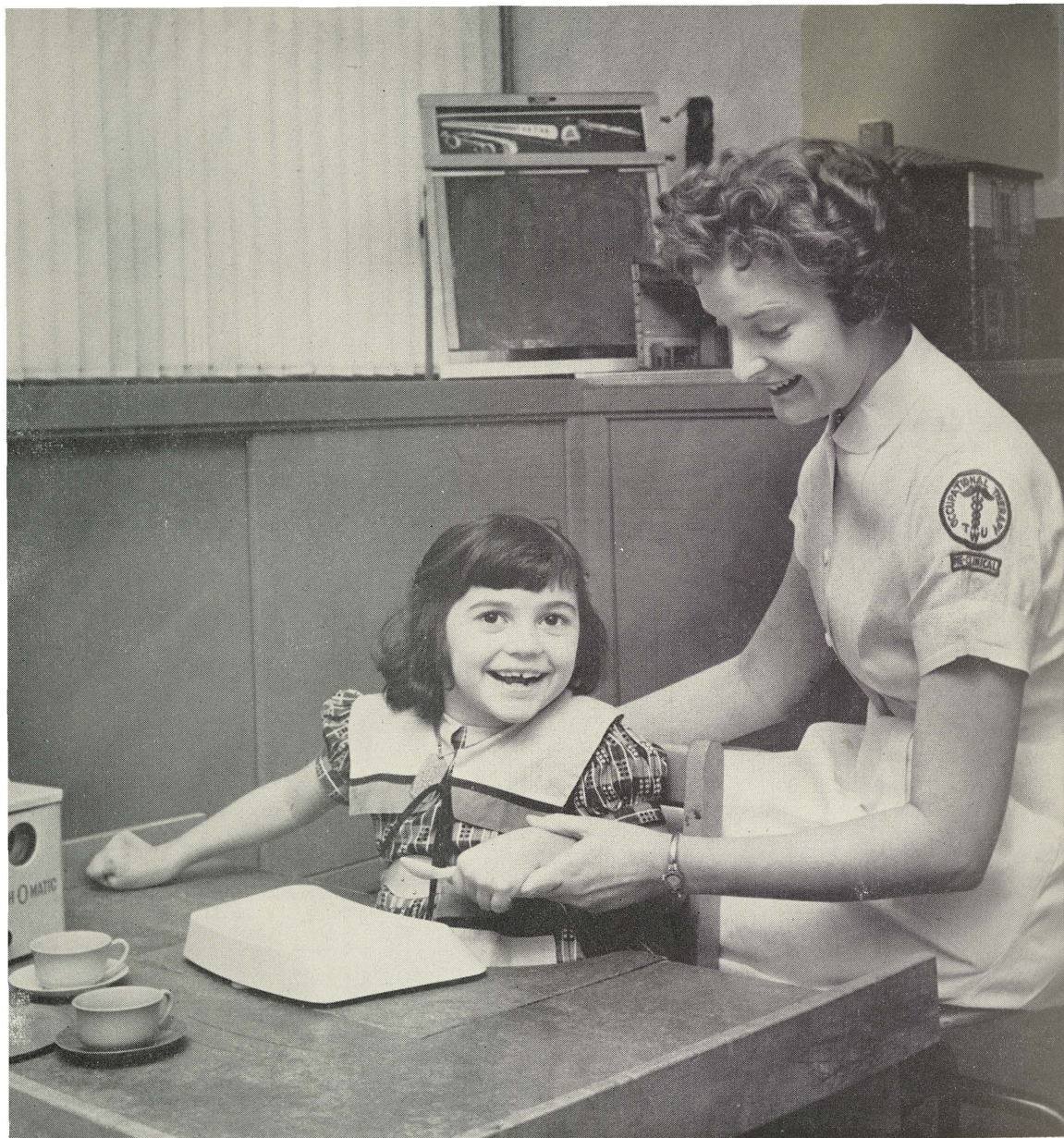
Realistic Training Is Important at the TWU School of Occupational Therapy