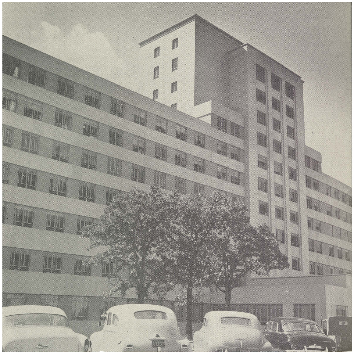
Parkland Hospital, Dallas, One of the Centers for Clinical Affiliation