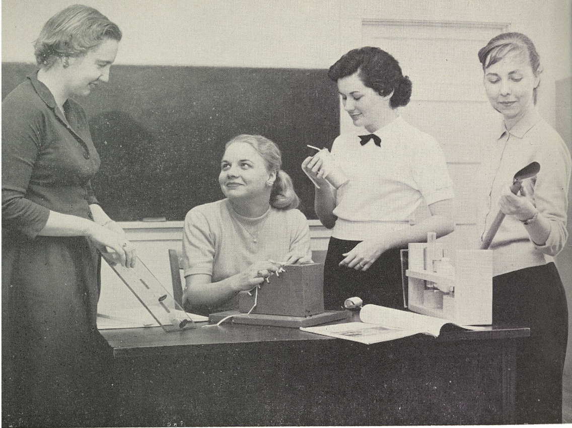
Demonstration of Adaptive Equipment to Be Used in Treatment of the Physically Handicapped