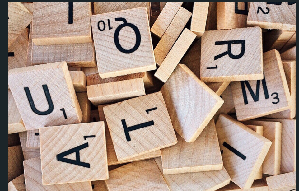
Workshops & Conferences