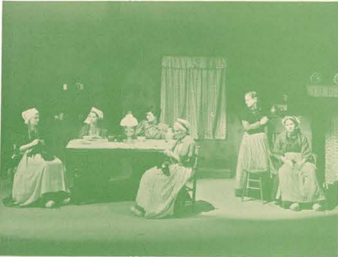
Scene from The Good Hope

The production activities will be carried on through a group of selected high school students. These groups will be known as "All-State Players" and "All-State Debaters," and will be selected from outstanding performers in the Interscholastic League meets. "All-State Players" will rehearse and perform a number of one-act and full-length plays. The "All-State Debaters" will engage in a series of practice and model debates on the question to be used in the Interscholastic League in 1938.