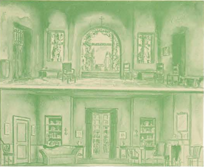
Designs for two plays produced last season. Lower: An English drawing room for Pygmalion ; Upper: A convent in Spain for The Cradle Song . Both designs use the same pieces of scenery in the same positions, with changes in treatment.

The special rate for board and room for the members of the high school group is given in the section on "Cost of Attendance."