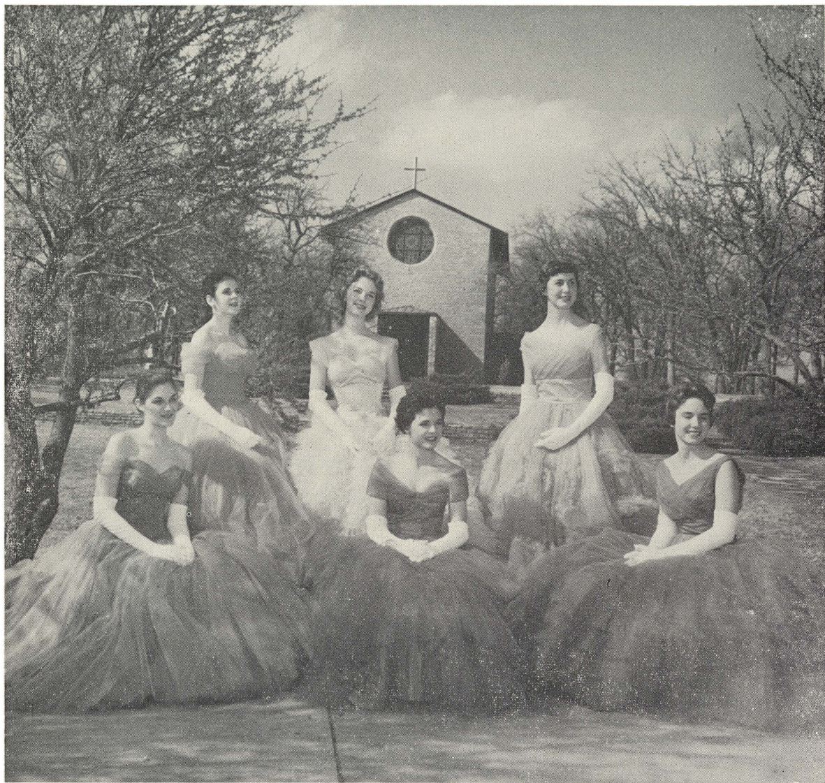
LITTLE CHAPEL-IN-THE-WOODS — One of the campus beauty spots